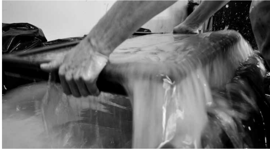
The author forming sheets at Cave Paper.